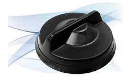
ULTRAMAX™ MIMO B Up to 7-in-1 LTE/MIMO, Wi-Fi x 4, GNSS Built-in ground plane