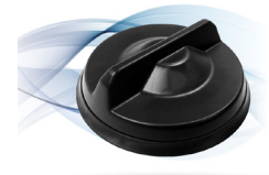
ULTRAMAX™ B Up to 3-in-1 Single LTE, Wi-Fi, GNSS Built-in ground plane