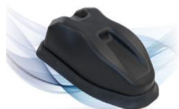
CENTURION™ Quad LTE Up to 9-in-1 LTE/MIMO x 4, Wi-Fi x 4, GNSS