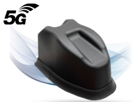
CENTURION™ Next Up to 9-in-1 Broadband 5G (600 MHz- 6 GHz) x 4, Wi-Fi 6 (2.4 GHz, 5.15-7.125 GHz) x 4, GNSS