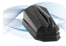
ULTRAMAX™ Up to 3-in-1 Single LTE, Wi-Fi, GNSS