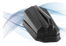
ULTRAMAX™ MIMO Up to 7-in-1 LTE/MIMO, Wi-Fi x 4, GNSS